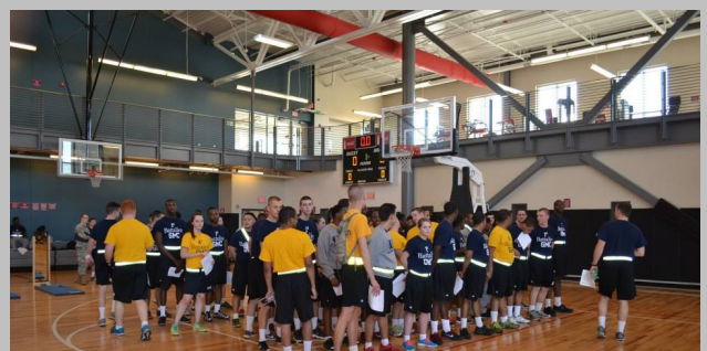
Top Left Clockwise: Military Honors Parade; Winter LDX; APFT; Plebe Week Activities