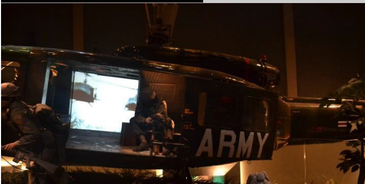
The LDX concluded with a visit to the National Infantry Museum