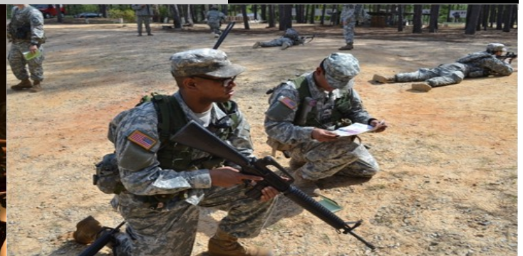
Tactical movement between events required Cadets to exercise leadership and tactical skills taught to them by MS4s.