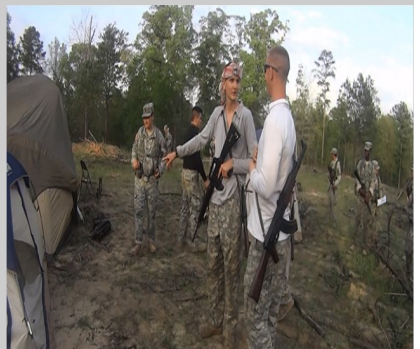
Cadet Adaptability and creative thinking tested at the Key Leader Engagement

consisted of an evolving tactical scenario and challenged Cadets' knowledge and skills in establishing an HLZ, treating a casualty, reacting to UXO, conducting an ambush, negotiating a minefield, conducting a KLE, and raiding a POW camp. Simulations Center training consisted of VBS3 and reconfigurable vehicle simulators to execute PLT level missions. The LDX concluded with a visit to the National Infantry Museum. Cadets exhibited a great deal of growth as future officers and left with a sense of accomplishment and confidence in their gained abilities.