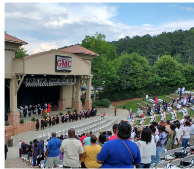
Family and friends watch proudly as the 2020-21 graduating class is lead into Brightmoor-Southern Grounds Amphitheatre.