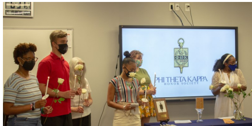
New Beta Sigma Chi members are inducted in formal ceremony on the Fayetteville campus on May 9.