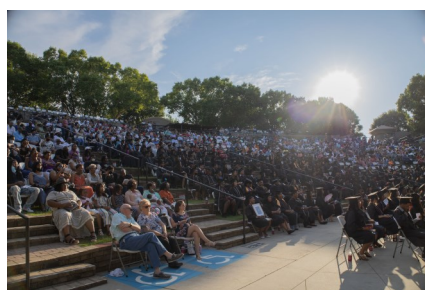
Despite the heat, large crowds came out to support the graduates.

Graduates included a record high number of dual enrolled students with 93 receiving their associates degrees. There were 5 graduates who received bachelor of applied science degrees. A video of the ceremony is available on YouTube at https://www.youtube.com/watch?v=raPr1V7KSWA .