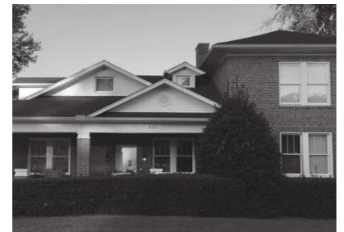
Academic Affairs Administration Building 421 South Jefferson Street, Milledgeville, GA. 31061